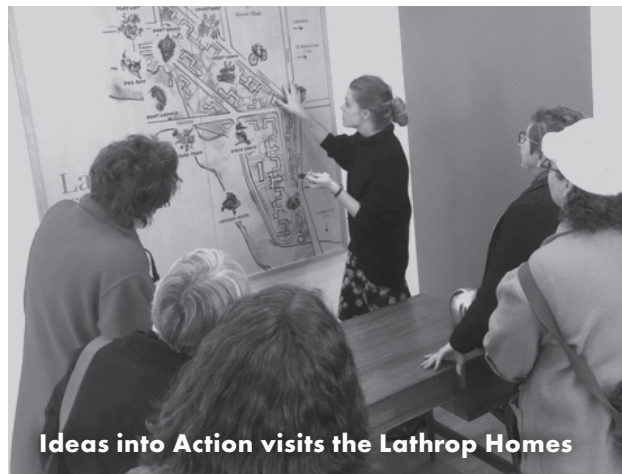
Ideas into Action visits the Lathrop Homes

Please include Forward Chicago in your end-of-year giving. Together our donors, our volunteers, Board Plus and Community Sponsors make all of this happen. We look forward to the next decade as one where we continue to grow—together.